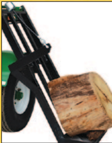
Back saving log lifter