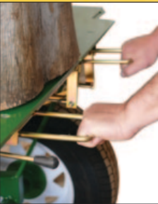
Double handed control system – keeps hands safe