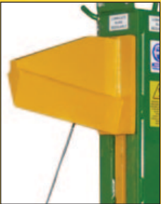
Patented vertical action sliding blade

Featuring the patented vertical sliding blade and the innovative double handed control system, the Superaxe range of wood splitters are Australia's safest and most user friendly.