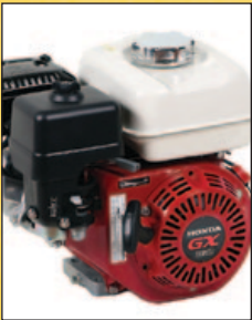
GX series Honda or V-Twin Vanguard engine options